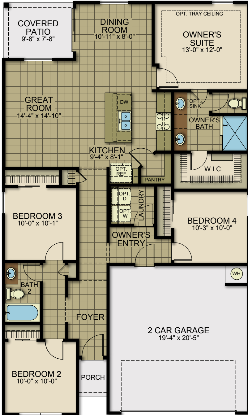
FLOOR PLAN 1,482 Sq.ft